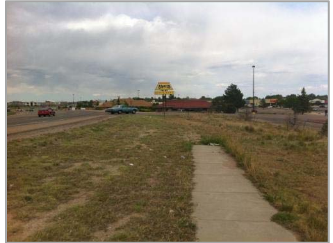
Figure 2. Phased sidewalk implementation on East Lincolnway.

Provide for efficient, comfortable, safe, and equitable movement and access along all public ways through a variety of modes of transportation, including automobiles, bicycles, pedestrians, and potentially transit. Develop and maintain balanced and flexible street designs (“complete streets”) for regional and local routes in a context sensitive and affordable manner through partnerships across all agencies and stakeholders that accommodate all potential users of the street and rights-of-way, so that the interests of a single mode of transportation do not unnecessarily compromise other modes of transportation.