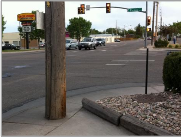
Figure 4. Utility pole limiting crosswalk access along East Pershing Boulevard.