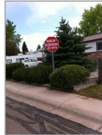
Figure 7. Front yard sign showing local resident concern about vehicle speeds.