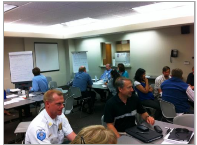
Figure 1. Workshop breakout group discussion.

The technical assistance entailed a day-long workshop involving a review of national complete streets policy guidance, current local transportation implementation processes, and brainstorming sessions on tools to assist the development of complete streets implementation strategies. About 30 staff from city and regional agencies in the Cheyenne region participated in the workshop, representing a range of transportation planning, traffic engineering, health services, housing, and fire/rescue agencies. Participation also included Cheyenne planning commissioners, the Wyoming Department of Transportation, the Federal Highway Administration and members of the development community.