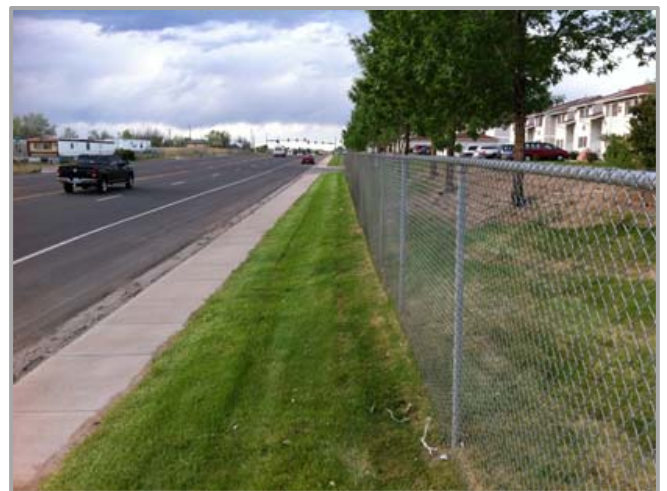
Figure 3. Fence limiting pedestrian connectivity along College Drive.