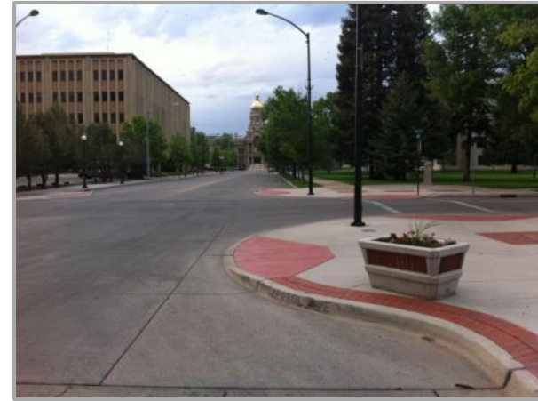
Figure 5. Downtown district pedestrian improvements.