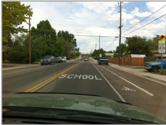
Figure 6. Retrofit bicycle and parking lane delineation.