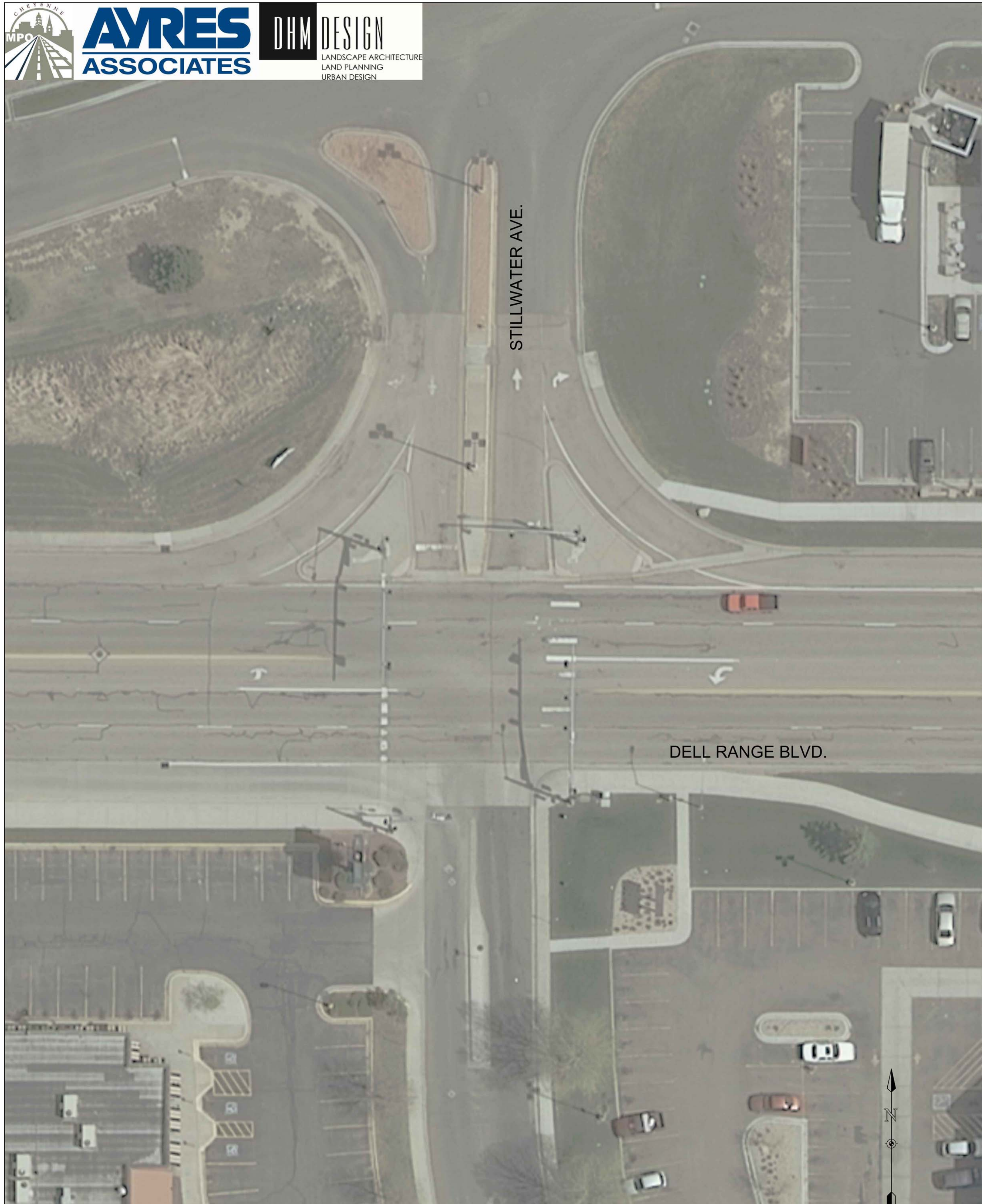
DELL RANGE BLVD. AND STILLWATER AVE. EXISTING INTERSECTION