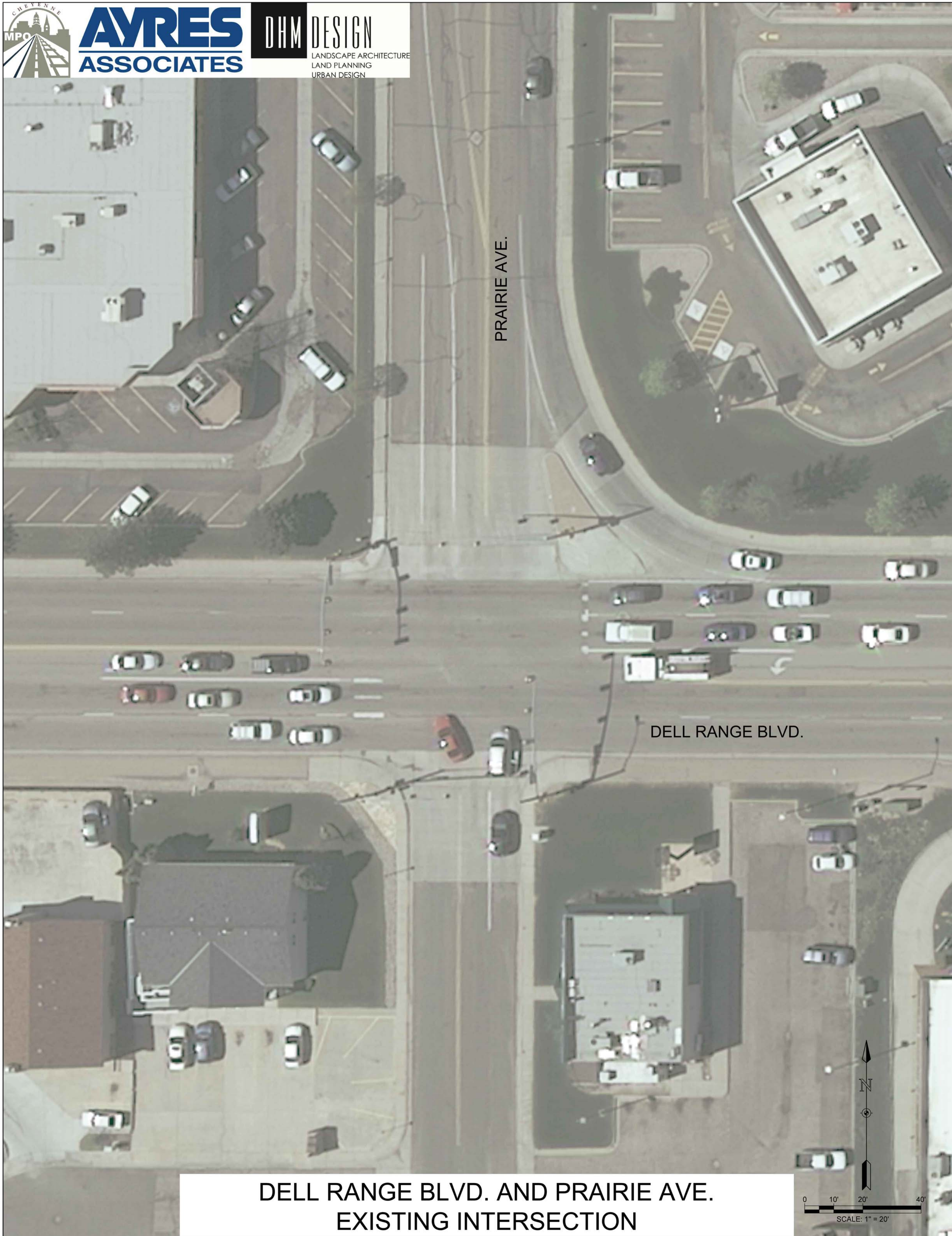
DELL RANGE BLVD. AND PRAIRIE AVE. EXISTING INTERSECTION