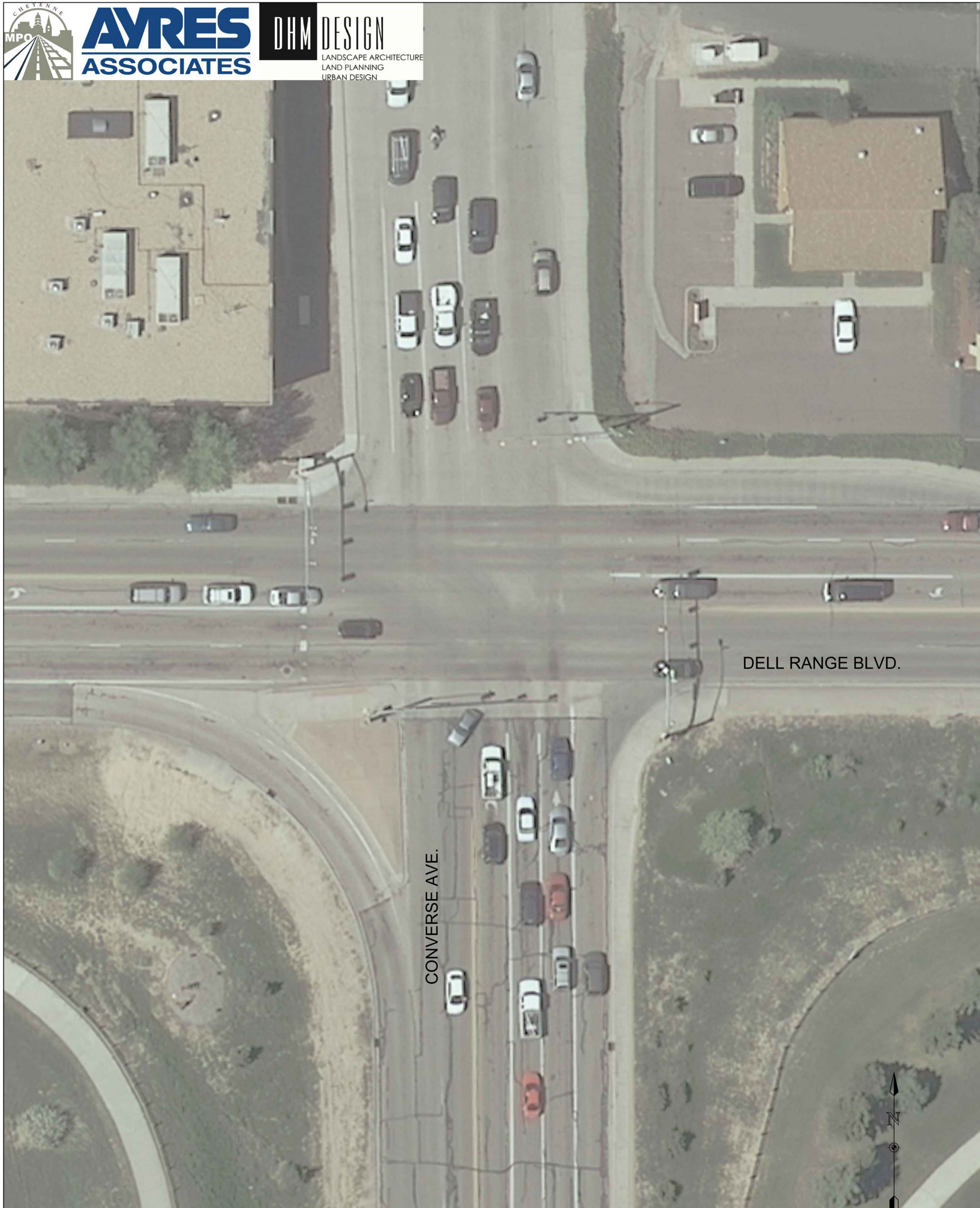
DELL RANGE BLVD. AND CONVERSE AVE. EXISTING INTERSECTION