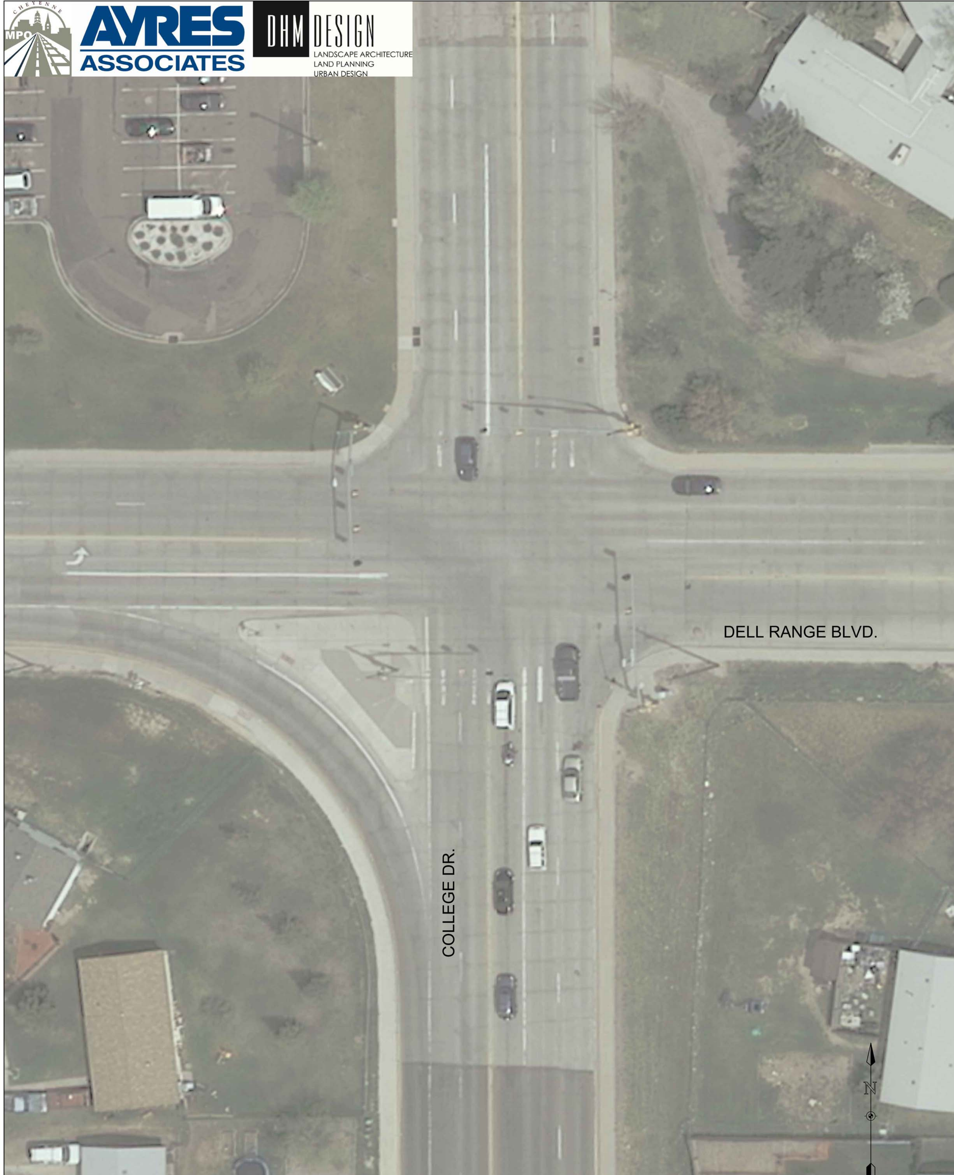
DELL RANGE BLVD. AND COLLEGE DR. EXISTING INTERSECTION