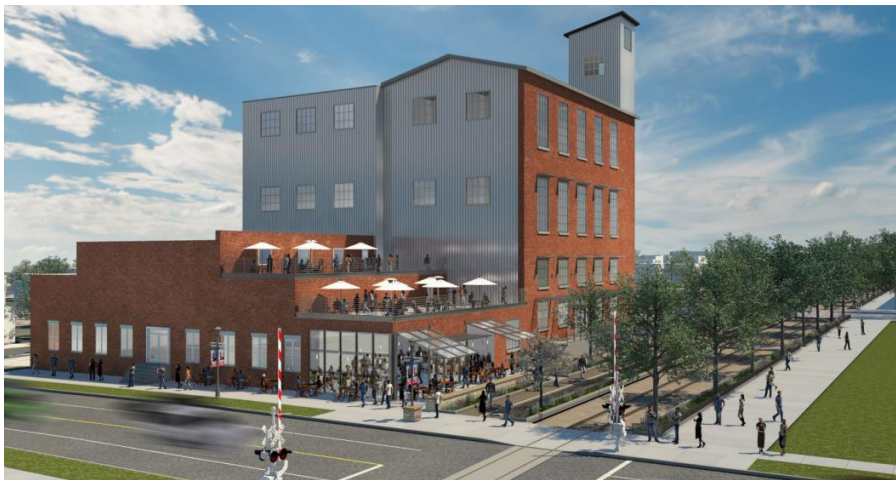
Adaptive Reuse Concept for Cheyenne's Steam Plant and a multiuse corridor on Reed Ave in the West Edge District

Cheyenne's West Edge district is a unique opportunity to create a thriving innovation district that is rich in character and an attractive place to live and work. Cheyenne's rich cultural history combined with growth opportunity creates a ripe setting for making a place that is unique, vital and memorable for residents and visitors alike. The planning for West Edge started with a grassroots base of local citizens and has continued to carry that momentum through active participation from the people of Cheyenne who best understand the potential of their community. The projects within West Edge help in bringing in greater density and amenities, especially targeting vacant and abandoned sites. The West Edge has already secured brownfields grants through the Environmental Protection Agency and Federal Emergency Management Agency. Grants, coupled with local funding and private investments have also jumpstarted a few projects within the district.