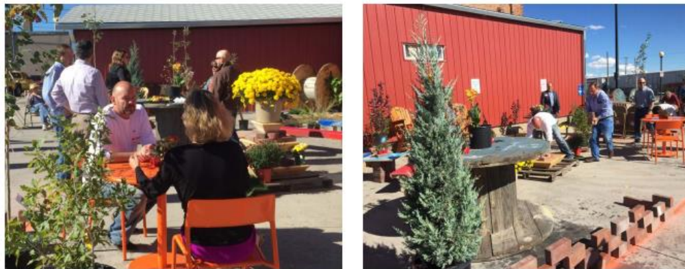
Tactical urbanism techniques being used to create parks in the West Edge District

Every project is unique and requires a context based approach to its public involvement strategy. This project with its unique needs would require a variety of techniques to get involvement and input from diverse stakeholders and members of the general public. The Consultants may use the MPO Public Participation Plan as a guide and work closely with the MPO's Public Engagement Support Team as well as staff to develop a public and stakeholder involvement strategy specifically tailored to this project.