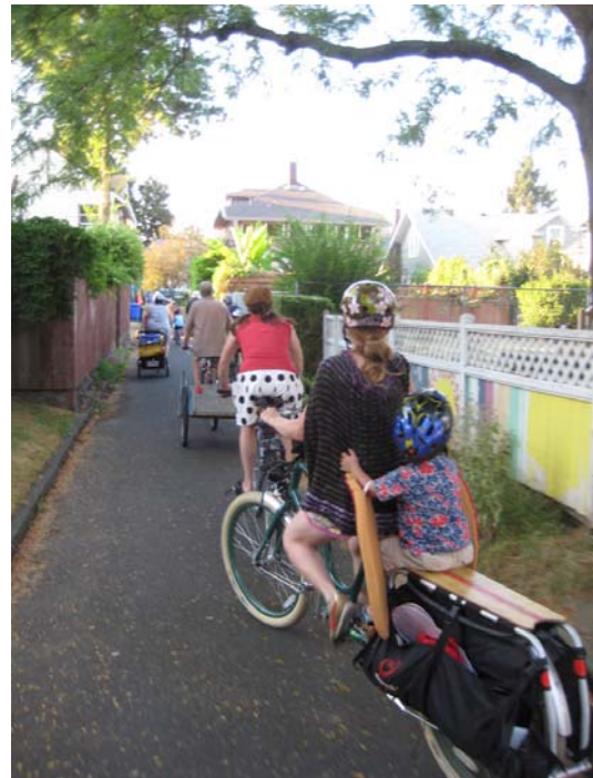
Low-stress group rides are an ideal way to introduce people to bicycling.

Rides may be aimed generally at new or less-confident riders, or they may be aimed at specific groups such as women, families with young children, or seniors. Rides will be more appealing if they have different routes each time, as well as different themes (e.g., public art tour, historic homes ride, Father's Day family ride, park-to-park tour, etc.) and/or feature some appealing incentive to participate (such as free sweet treat samples from local merchants, or bike bells for participants).