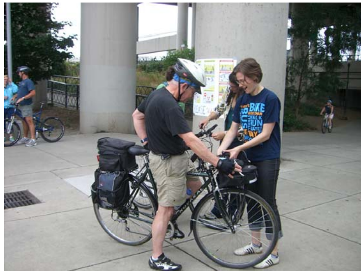
A volunteer transportation ambassador installs a free bike bell during a "Share the Path" event.

Many Cheyenne residents who love bicycling would be willing to volunteer if they were provided with a well-organized opportunity to contribute. Creating and managing a volunteer ambassador program does take time, but it can also expand community capacity and create goodwill in the community. The City Attorney should be contacted prior to establishing a Volunteer Ambassador program to identify the City's standard practices relating to volunteering and liability concerns. For example, it may be necessary to complete background checks for volunteers if they may interact with children.