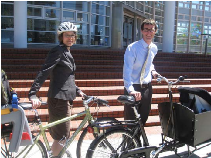
Events and messages during Bike Month can encourage people to bike to work.