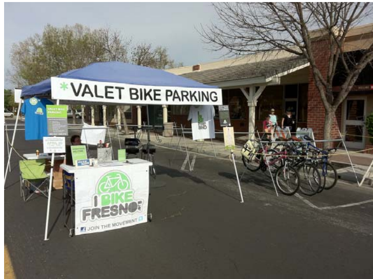
Valet bike parking offers people who arrive by bike convenient, secure storage.

Providing convenient, secure bike parking at large events can make bicycling to an event a more attractive option. Arenas, parks, and other venues and gathering places often do not have the bike parking capacity to accommodate very large crowds. Temporary facilities, such as corrals or mobile racks, can be brought on site to meet the demand. This type of service can also prevent damage to non-parking facilities, such as trees and hand rails that bicyclists use when appropriate facilities are lacking. Temporary bike parking can be staffed or used with standard locks to ensure security.