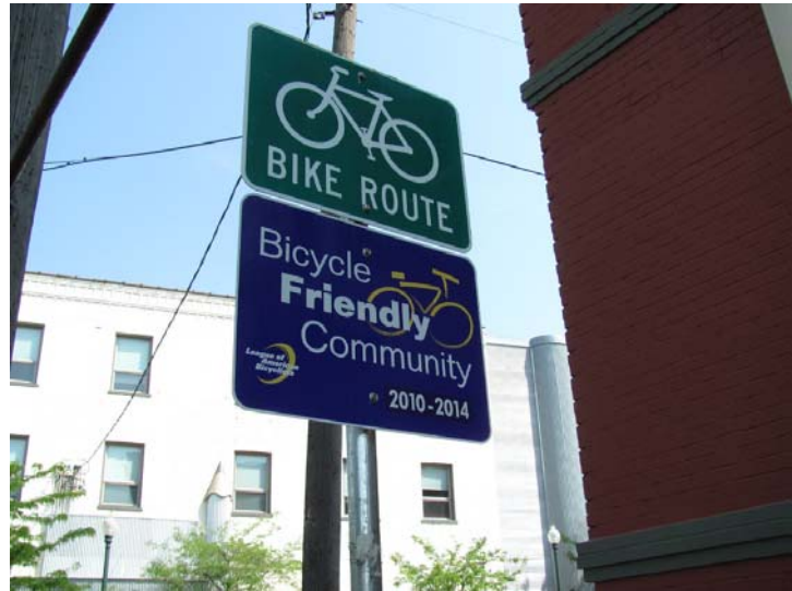
Cities can apply to be recognized as Bicycle-Friendly Communities.

The League of American Bicyclists has a well-respected Bicycle Friendly Communities (BFC) award program. The League recognizes four tiers of bicycle friendly communities: bronze, silver, gold and platinum. Communities fill out a detailed application that covers bike-related facilities, plans, education efforts, promotion initiatives, and evaluation work that has been completed by the jurisdiction. The award is designed to recognize progress that has been made, as well as assist communities in identifying priority projects to improve bicycling conditions. Receiving the award is a media-worthy event, and may give elected officials the opportunity to receive media coverage for the positive work they are doing.