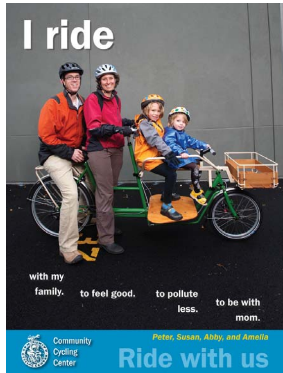
A media campaign showing "real people" riding bicycles can help to raise the acceptance of bicycling for everyday transportation.

A good photographer should be engaged, and opportunities for people to be photographed should be created (such as at public bicycling events). Key community members should be invited to participate as well, particularly if they are well-known. For example, the director of the Wyoming Department of Transportation is a bicycle racer and should be invited to be one of the first faces of a media campaign. Other people may be invited to participate because they demonstrate that women, families, or older residents ride bicycles in Cheyenne.