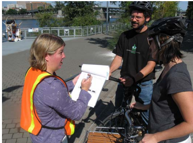
Volunteers or agency staff should count and/or survey bicyclists on an annual basis.

In order to determine this Plan's success at increasing bicycling rates and bicycling safety, it is necessary to establish an annual data collection program. At a minimum, this program should tally the number of cyclists and greenway users at key locations around the community (particularly at pinch points, in downtown, near schools, and on the greenways); the same locations should be counted in the same manner annually. If major bikeway or greenway infrastructure projects are planned, baseline and post-construction user counts can be performed through this coordinated annual count process for maximum efficiency. This will provide the City and MPO with information about growth of bicycling rates.